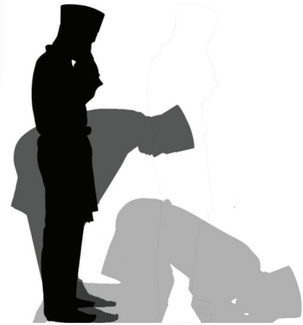
Salat (Muslim Prayer)

Truth: The Islamic Prayer ( Salat ) is one of the five pillars of Islam. Muslims stand before God and express faith, give thanks for blessings, and seek guidance and forgiveness. During Islamic prayer, Muslims follow the example of the prophets who fell on their faces worshipping God in a modest, submissive and respectful way. Similarly Muslims express their utmost humility before the Almighty by bowing and prostrating in prayer.